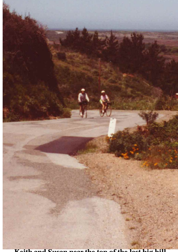
Keith and Susan near the top of the last big hill

There is no need to detail the remainder of the climb. True, it was next to a cow pasture, but I'm sure you've all heard the sound of cows giggling. My wheels turned fast enough to prevent any spider webs from forming between my wheels and the cow fence as I zoomed my way to the top.