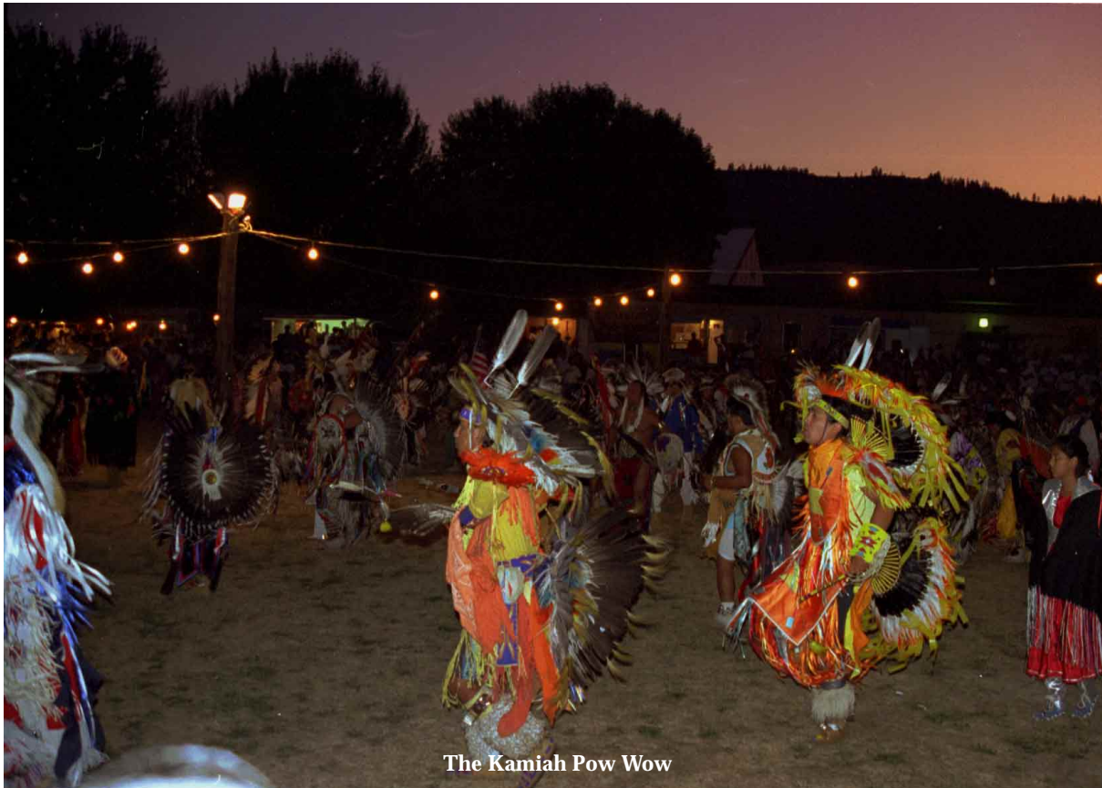
The Kamiah Pow Wow

proportions. It is almost frightening how large her feet and ankles have become. She goes back to the motel to try to drain her feet but joins us later again at the Pow Wow.