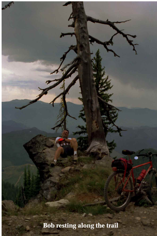
Bob resting along the trail

Shortly after our tent was up, Barb had supper ready for us—haystack—which is corn chips, chili, beans, lettuce, cheese, tomatoes, and onions. The ingredients are just laid out and you put them together in the combination you want. While we eat, ashes from the forest fire rain down on us.